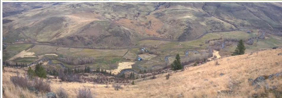
Bird Track Springs Fish Habitat Restoration 30% Design